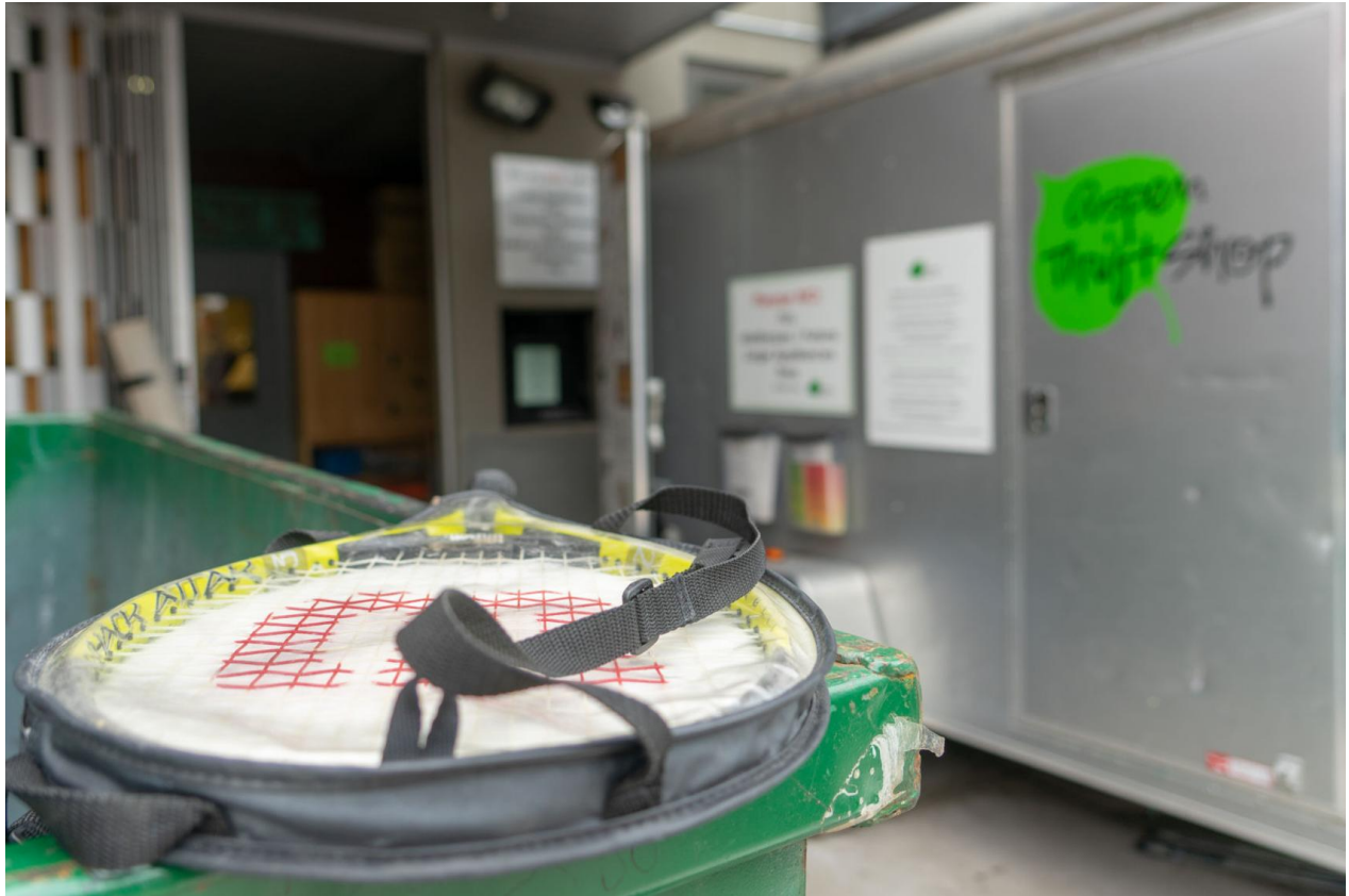
A well-worn tennis racquet awaits pickup and sorting in the backroom receiving area by the staff at the Aspen Thrift Shop on a recent morning.

In addition to the many great deals that can be found in the walls of the Aspen Thrift Shop, the organization also gives back over 80 percent of its profits in the form of grants and scholarships. That amounted to more than $600,000 in 2017. The list of grant recipients includes over 200 nonprofits ranging from education groups and the arts to environmental and community supporters. The shop also gives out $75,000 in scholarships to graduating Aspen, Basalt and Roaring Fork High School students each spring.