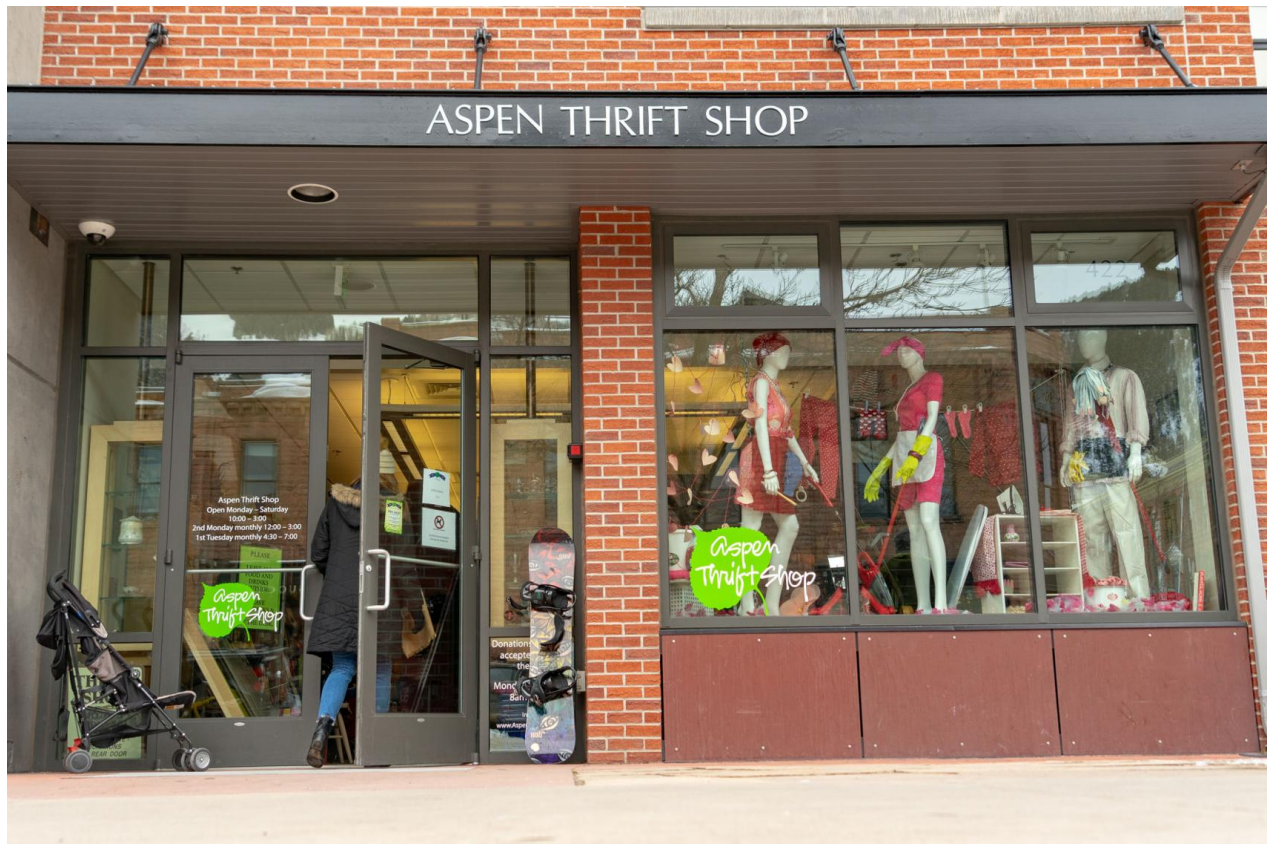
The creative staff at the Aspen Thrift Shop add levity and a dash of whimsy to the mannequins in the storefront windows, all from donated items.

To help with promotion, the shop will be hosting a “bag sale,” which reaches back far in the history of the shop. For three days at the end of February, customers will be able to fill a bag at the shop for a set price, which could help folks get some great deals. The goal of the bag sale is to get the shop as empty as possible so the volunteers can close for a week for a deep clean.